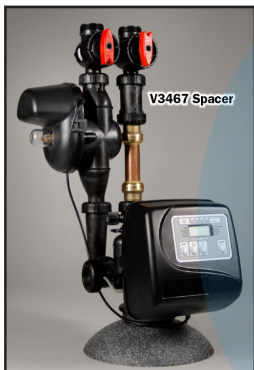
No Hard Water Bypass shown for single unit applications with optional accessories.