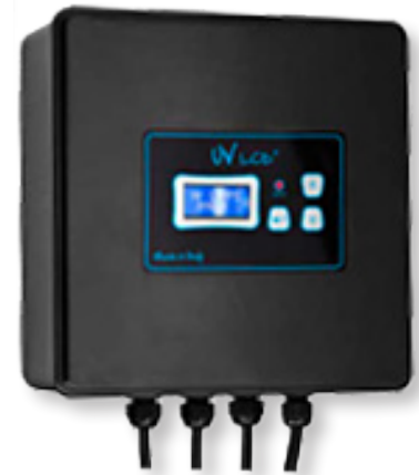
LCD 2 (PLUS)